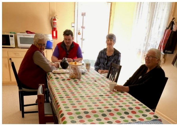
Coffee and chat at Delegate Op Shop

Specific outreach initiatives : Family service, Coffee and chat at Delegate op shop, soup lunches at Delegate, general help and outreach at Bombala op shop.