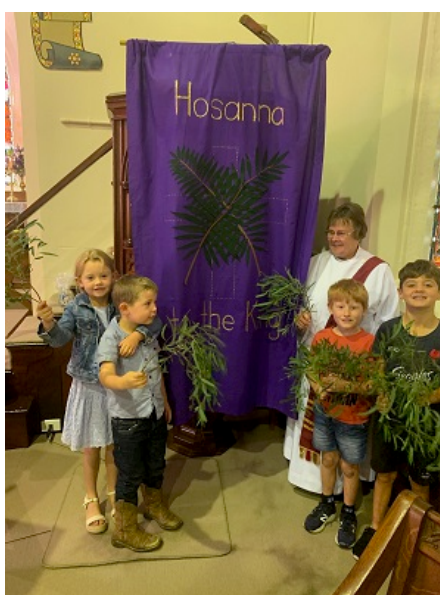
Palm Sunday family service

Family service – less formal, but usually following the lectionary, not always all the readings, with a story and activity for the children. The music also incorporates easy choruses as well as hymns. The children and their parents participate in the readings and intercessions.