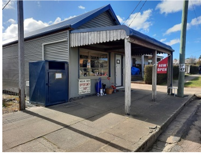
Bombala Op Shop in Maybe Street

Op-shop: Two, one in Bombala in rent free premises (courtesy of local businessman) in Maybe Street, open 5 days a week, and one in Delegate parish hall, open 3 half days a week.