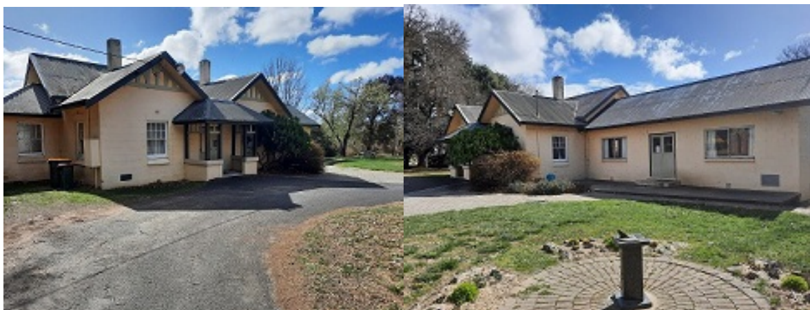
Two views of St Matthias Parish Hall

being used for church activities, is also regularly rented by the local dance school, and occasionally by other community members for diverse purposes such as art activities and relaxation/meditation classes. The hall in Bombala had a recent kitchen renovation and has disabled access and disabled toilet facilities. All the buildings and grounds are maintained as well as we are able and are in reasonable condition.