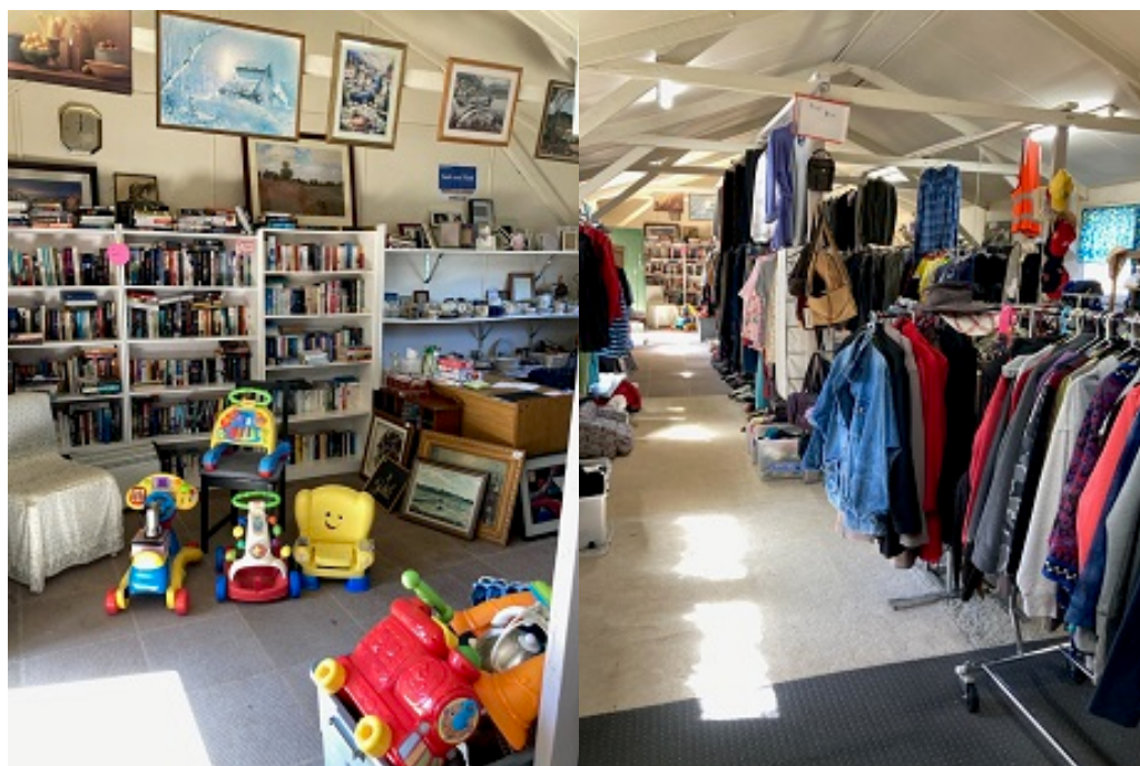
Two Views of the Op Shop in the Delegate Parish Hall