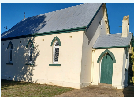
ST THOMAS', BINLONG