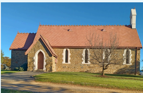
ST PAUL'S, MURRUMBURRAH

Furthermore, regular attendance at Deanery meetings is necessary to fulfill the responsibilities of the position.