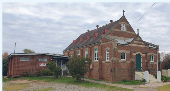
SALT AND OP SHOP, MURRUMBURRAH