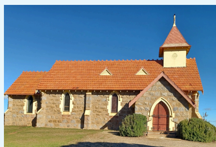
ST MARK'S, CURRAWONG