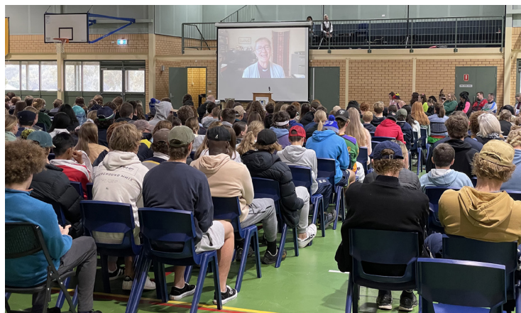
This story and photo was first published in The Melbourne Anglican. Reproduced with permission.